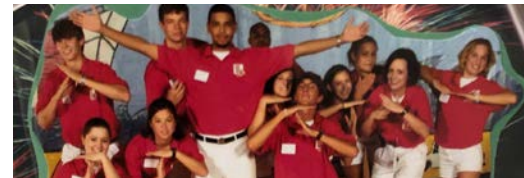
2002 Tories (L) & Whigs (R)

Home Groups Haz Mat Life Guards Red Cross Firemen National Guard Ski Patrol Police Forest Rangers Coast Guard Paramedics