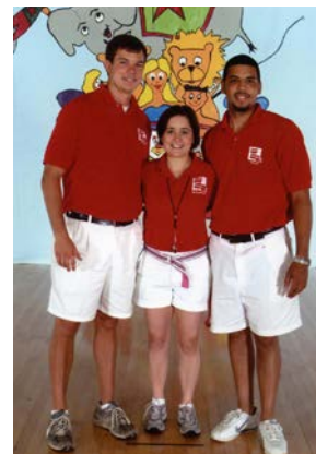
2004 Program Directors

Home Groups Sweet Potatoes Crawfish Emus Roosters Field Mice Corn Crop Dusters Scarecrows Tractors Sugar Cane