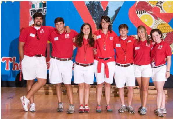
2008 Head Table

Home Groups Beaches Coral Reefs Hammocks Palm Trees Surfboards Ukuleles Coconuts Grass Skirts Luau's Sunsets Tiki Torches Volcanos