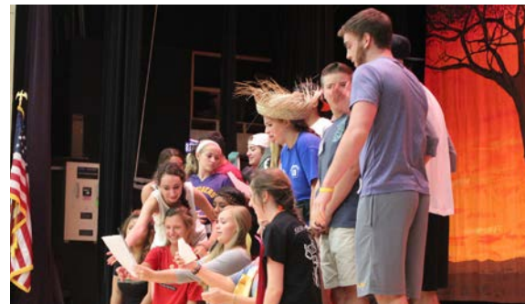
2014 Home Group performing in the Song Competition

planned and surprise contests throughout the week in which home groups compete against one another to win awards and earn points toward the ultimate goal of winning group of the day/group of week- symbolized by the coveted LYS flag. (Competitions include: Skit, Song, Group of the Day )