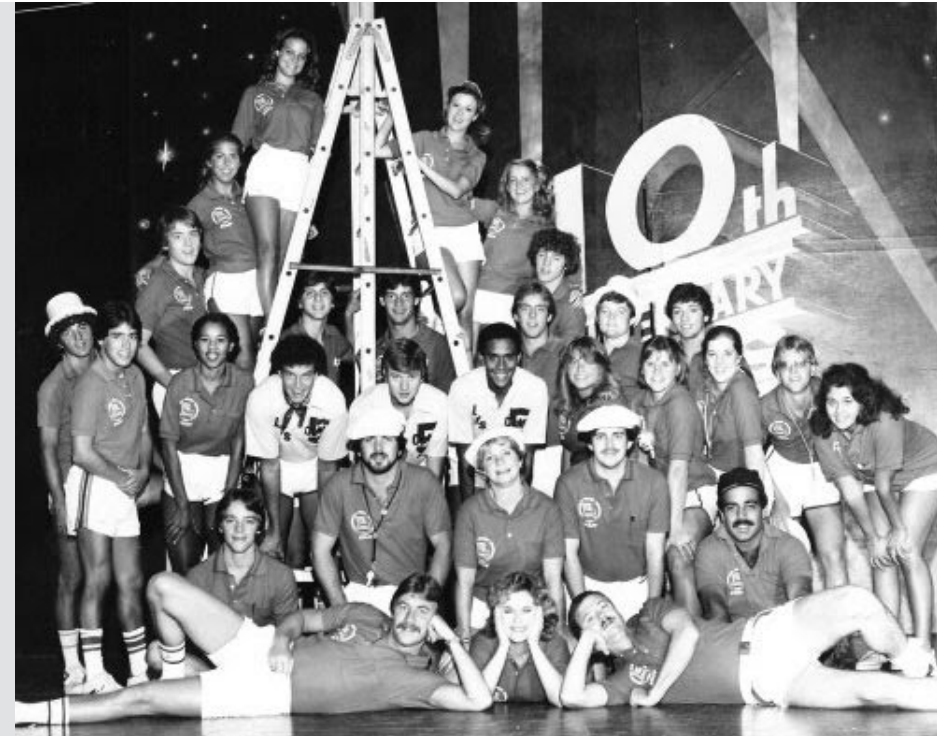
Pictured above is the program and executive staff of the 10th Louisiana Youth Seminar.

May your hands always be busy May your feet always be swift May you have a strong foundation When the winds of changes shift May your heart always be joyful And may your song always be sung May you stay forever young Forever young, forever young May you stay forever young.