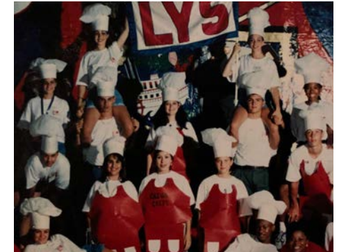
1995 Home Group