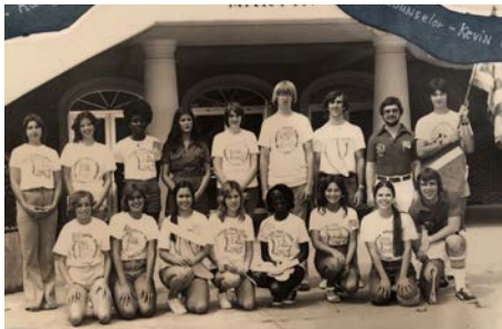
1976 Home Group

Confidence Patience Understanding Dedication Loyalty Insight Compassion Responsibility Potential Compromise Concern Reality