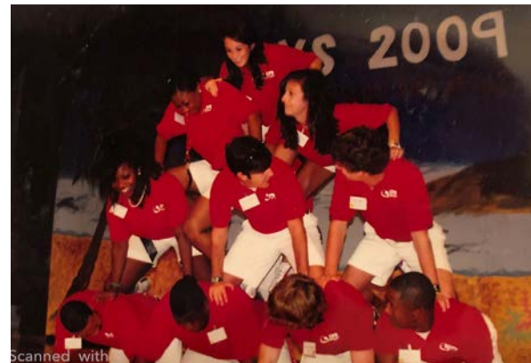
2009 JC Dance