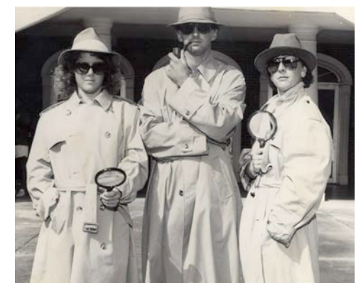
1986 Staff Assistants

In 1985, the LYS Executive Committee became fully functional operating LYS year round. Previously, LYS was administered in with partnership with University officials.