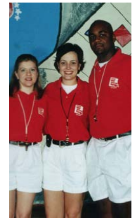
2000, 2001 Directors