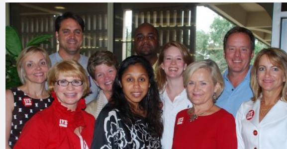
2009 LYS Board of Directors July Meeting