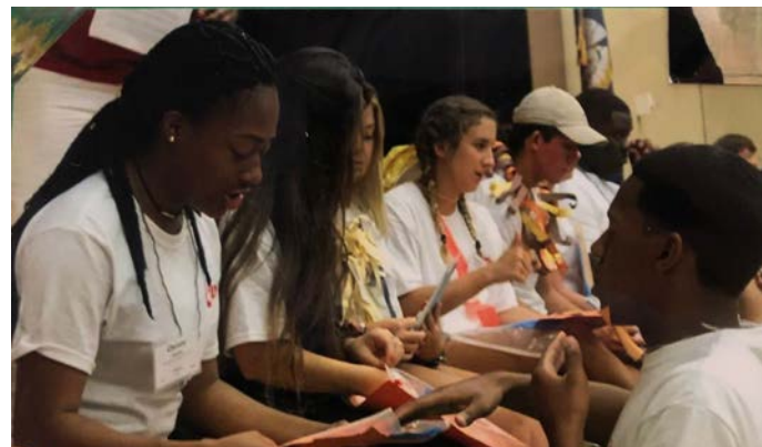
2017 Delegates in Communication Connection