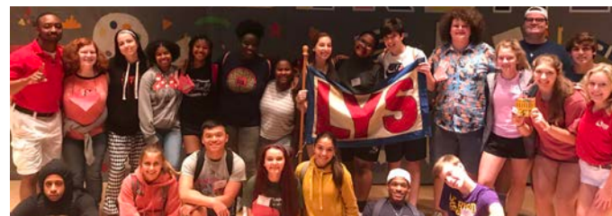
2019 Group of the Week with the flag