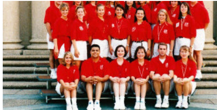
1994 Staff Members

In 1994, the General Session Communication Connection appeared replacing Brainstorming. This session continues to this day.