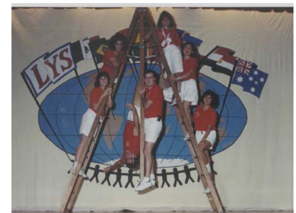
1989 Head Table