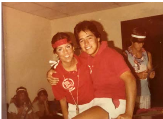
1984 Red Shirts

Home Groups Nancy Drew Ellory Queen Nero Wolfe Columbo Mike Hammer Hardy Boys Magnum P.I. Sherlock Holmes Sam Spade Kojak Carlie Chan Dick Tracy